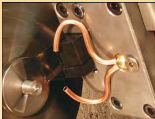
TwinPop nozzle shown installed in lathe turret.